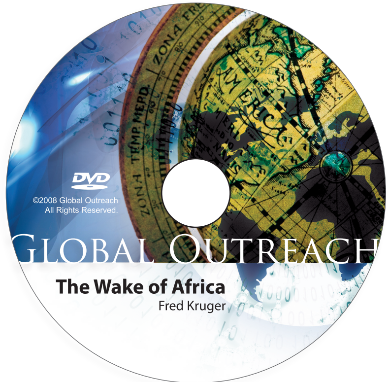
full color photos with shifting tones

Be sure to send your layout file as well as any linked* images associated with your artwork. Be sure to convert your fonts to paths or outlines before submitting your artwork.